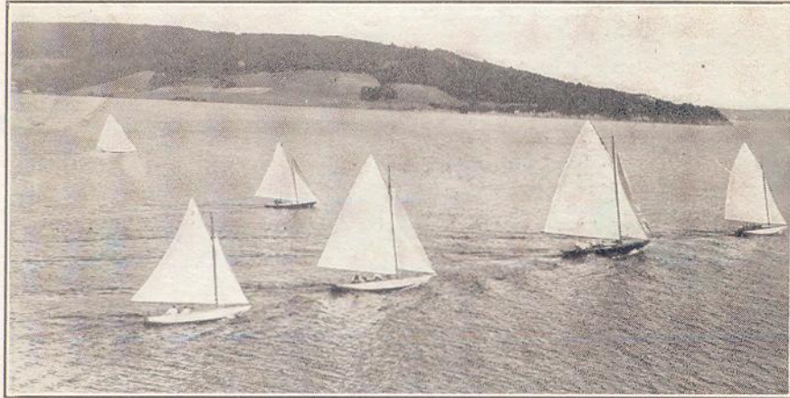
REGATTA AT BADDECK, C. B., NOVA SCOTIA, 1913

Commencing on July 22, 1913, under the auspices of the Cape Breton Yacht Racing Association, the first Regatta was held at the Bras d'Or Yacht Club. In the 40s and 50s, Snipes were towed from North Sydney and Sydney to Baddeck and back again for annual Regattas.